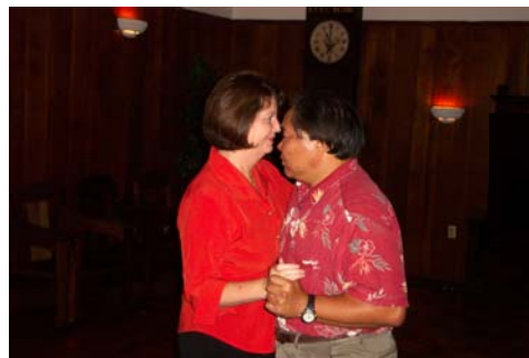
Happy 27 th Anniversary