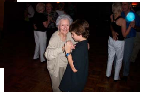
May I have this dance!

A big Thank You to Paradise Records for donating the prizes for the picture photo contest. Visit Paradise Records and check out their Beach Music section.