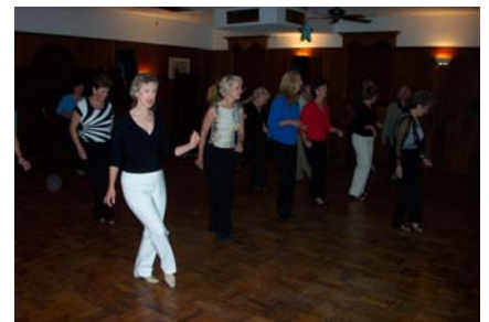
Line Dances are great fun!