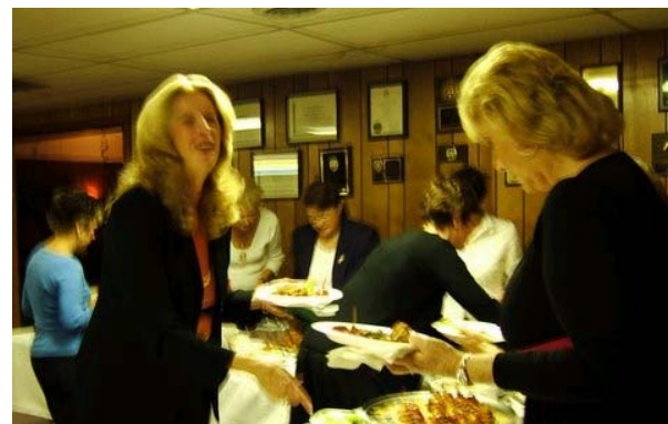
Nov. party photos courtesy of Alvia Locklear.