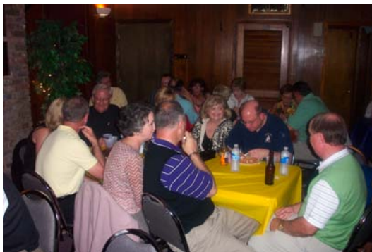
Eating and socializing