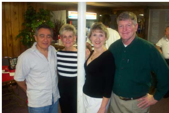
April Party Committee