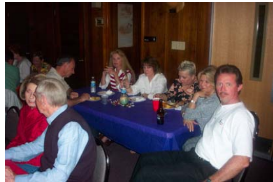
Our Carolina Shaggers Friends