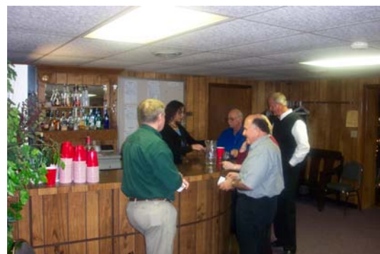
Getting a drink to go with the eating