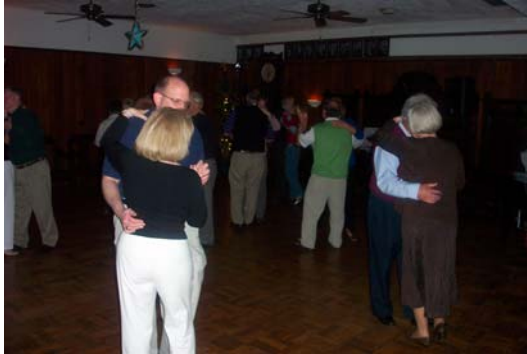
Belt buckle polishing time