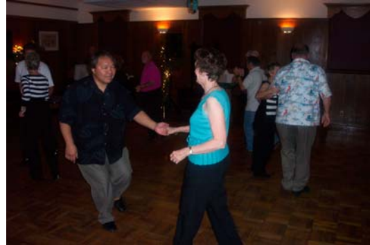
Dancing with old friends