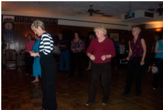
Line dance time