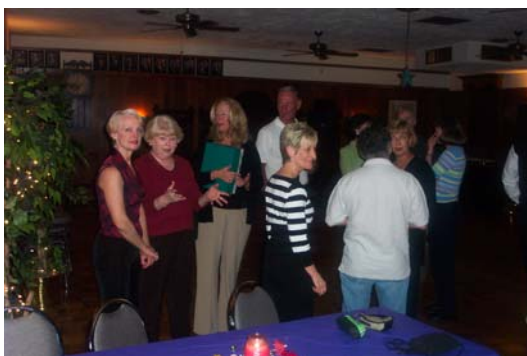
Socializing and not eating