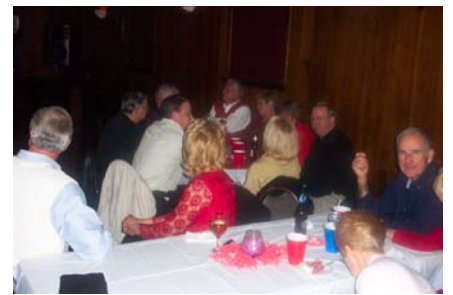
Resting between dances