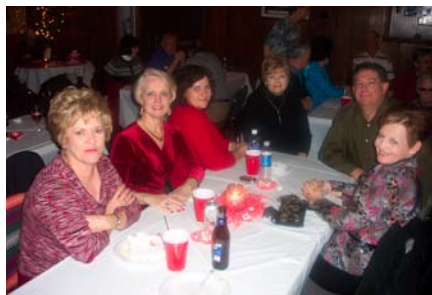
Roland's Dance Studio Guests