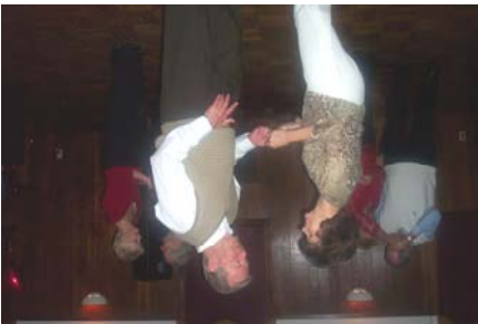
This sure is great music