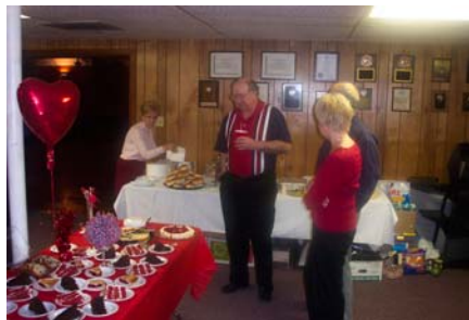
Those sure look like good deserts