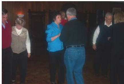
Cutting the "rug"