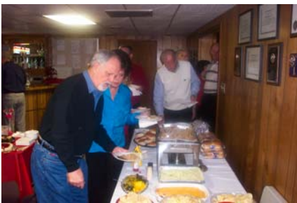
Let's Eat !!