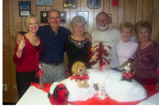
Feb Party Committee - Great Job!!